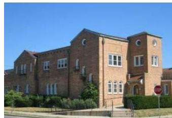
Inspiration Studios 1500 S 73rd St, West Allis

Help is needed to get the space up and running before the VPW's spring show, Marvin's Room .